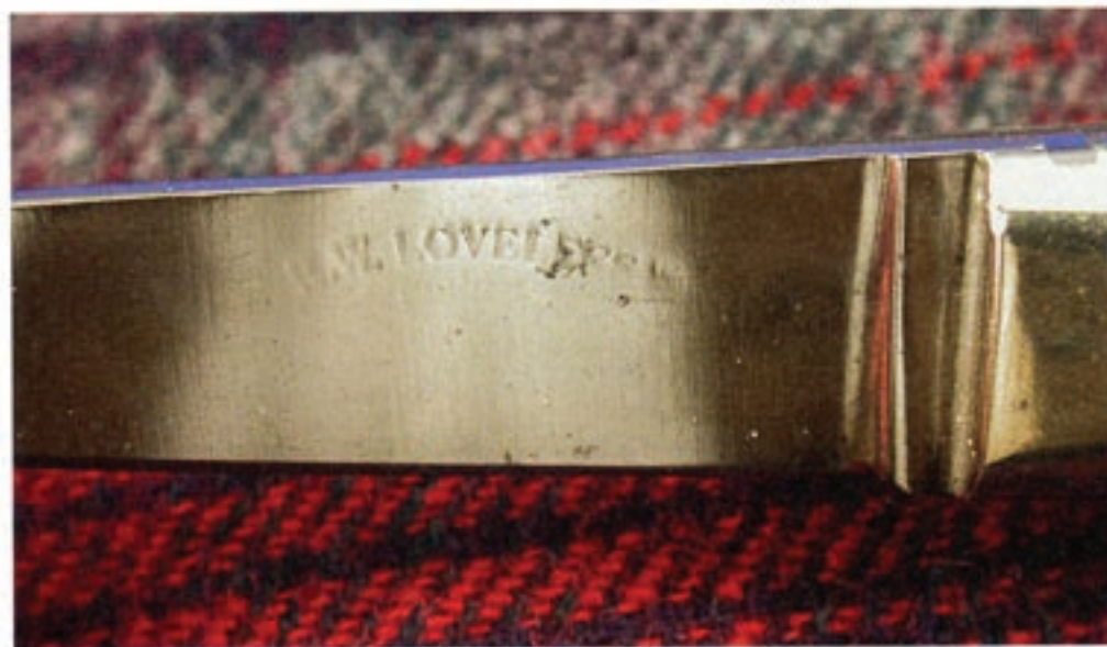
An early Loveless logo marks this first Stiffhorn.