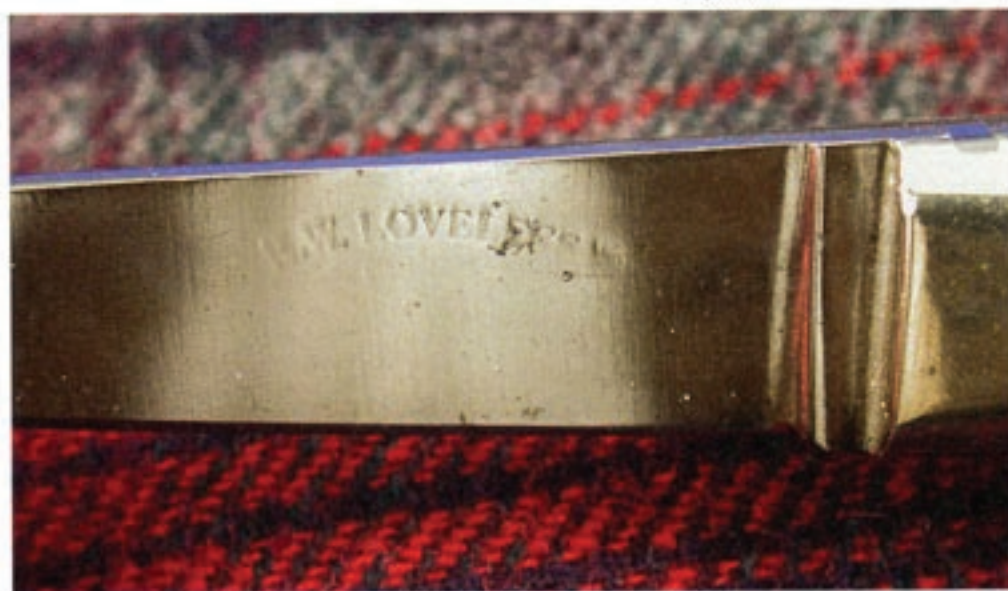
An early Loveless logo marks this first Stiffhorn.